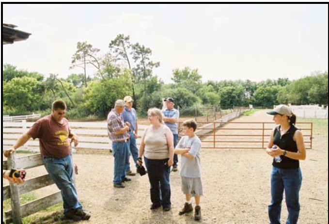
South Dakota State University Sheep Unit Tour