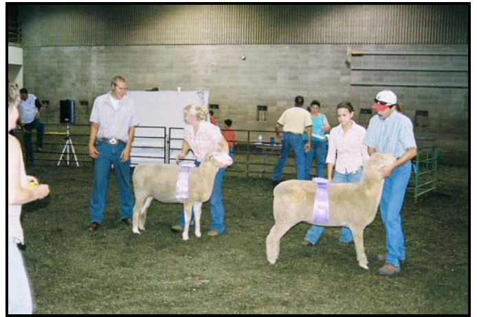
2006 Champion & Reserve Champion Ewes – University of Wisconsin Madison